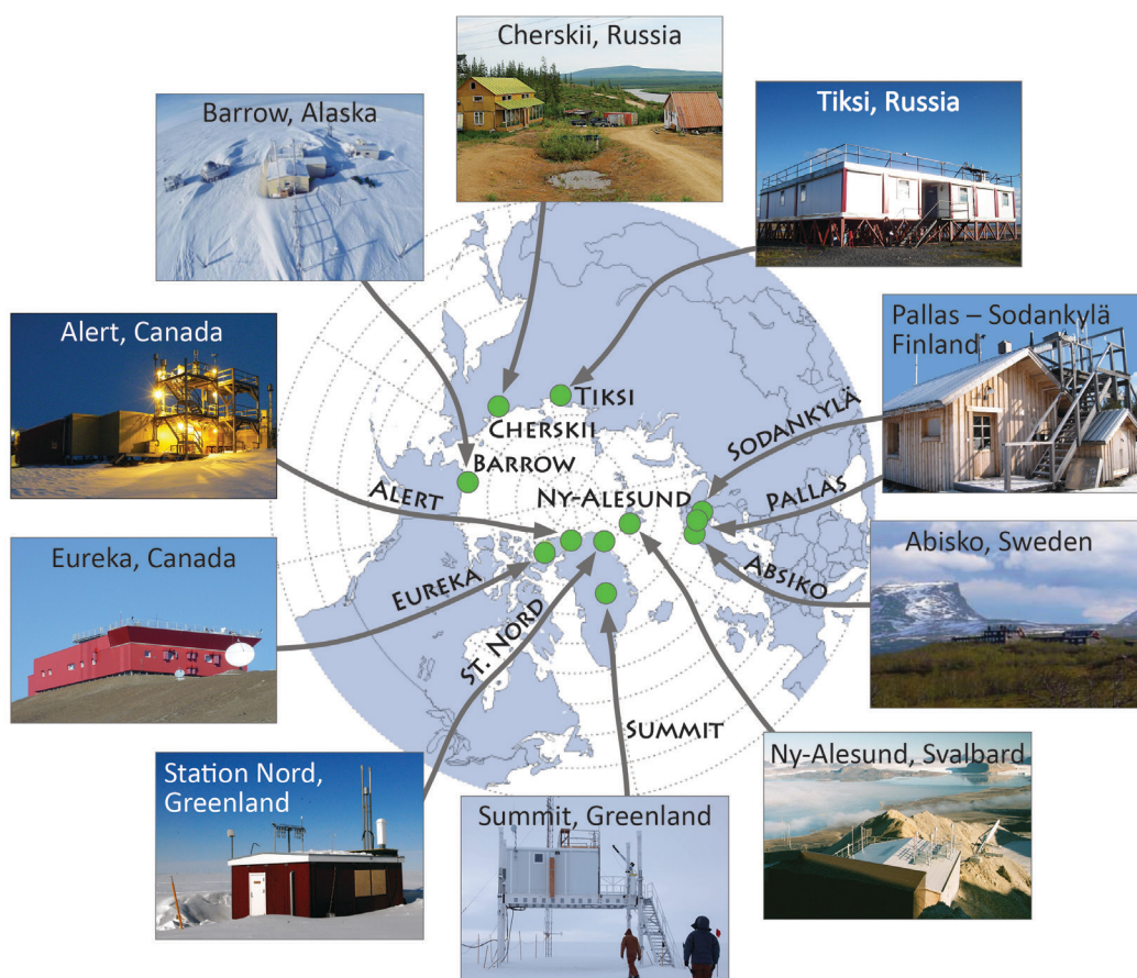
Figure 1. The location of the ten observatories of the IASOA consortium. Station Nord, Greenland is the most recent addition to the consortium.

For IASOA, issues of design are closely linked to coordination, where independent funding agencies recognize the enhanced value of contributing to common targets for which the pan-Arctic perspective is essential (e.g. ozone match experiments). There are many viable targets to contribute to a pan-Arctic perspective on atmospheric chemistry, atmospheric physics and the interactions between the atmosphere and surface processes. This white paper presents the current important targets for IASOA initiatives, with a view towards improving network design and utilization at long-term observatories. These targets emerged as starting points due to a combination of data readiness and subject relevance; they are not an exhaustive list of the potential IASOA science contributions. Each emphasizes the value of entraining use perspectives in developing these targets.