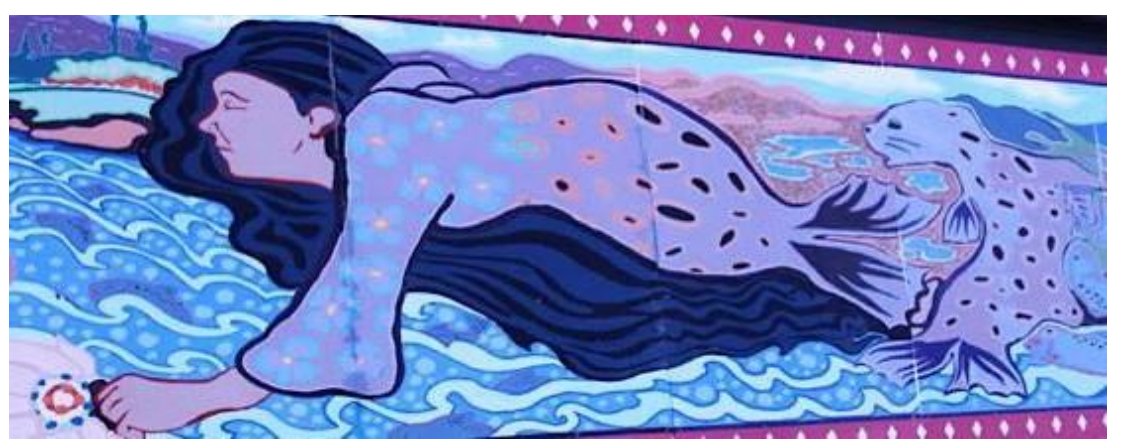
Mural on the Yupiit Piciryarait Cultural Center.

In reflection of all the management systems, participants agreed that there is room to make all of them better and much more responsive to all of our people.