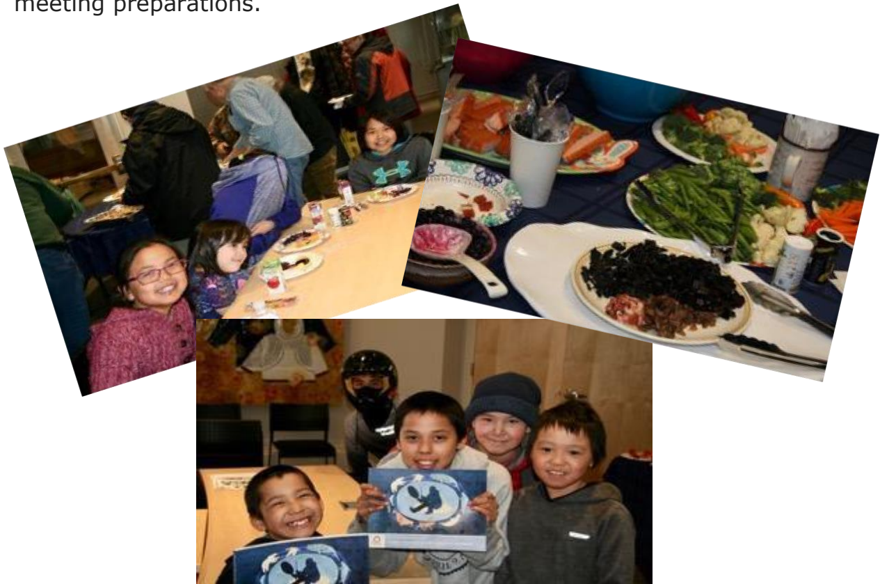
Photos taken at the Potluck hosted by the Katirvik Cultural Center.