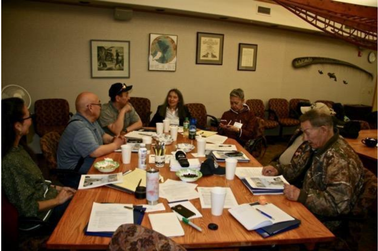
Members of the FSSG Advisory Committee meet the day before the Focus Group Meeting – Inuit Past and Current Managers of Marine Resources.