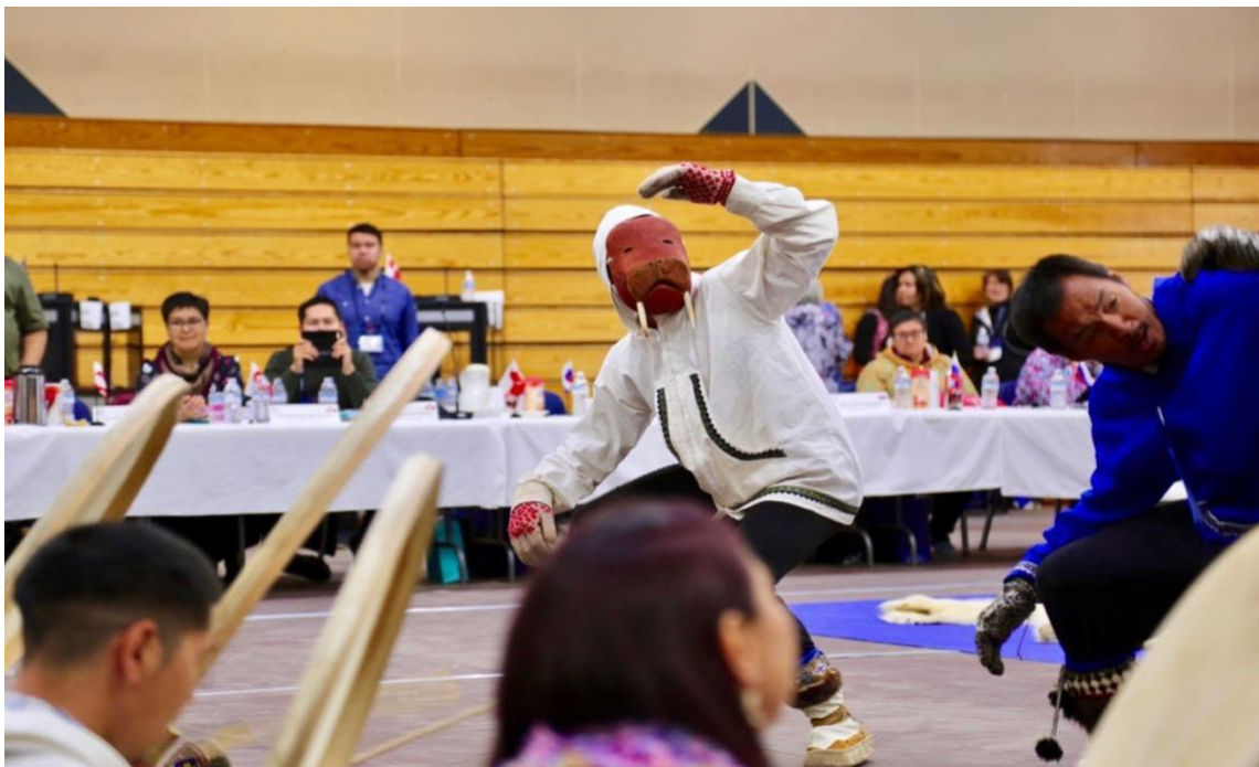
King Island Dancers at the Inuit Circumpolar Council General Assembly 2018.

The Eskimo Walrus Commission Focus Group on food sovereignty and self-governance facilitated greater understanding of the Inuit role in current co-management systems and the tools needed to achieve greater equity of voice. The Focus Group was the first of four and provided an important foundational block in the Food Sovereignty and Self Governance project.