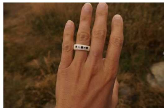
Ring made of walrus and mammoth ivory.

The lobbying to address walrus habitat loss and on the ban on sale of walrus and mammoth ivory by others takes a single species approach and does not consider that the harvesting of walrus is one of the strongest examples of Sustainable Harvesting by Inuit that the world could learn from.